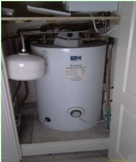
Cylinder & Thermostat