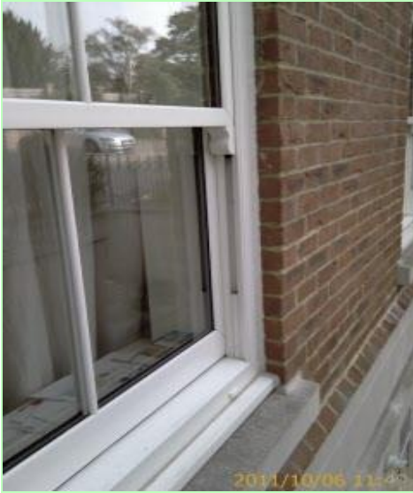
wall thickness over 275mm